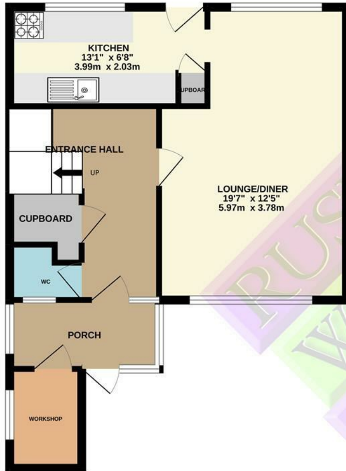
GROUND FLOOR 516 sq.ft. (47.9 sq.m.) approx.